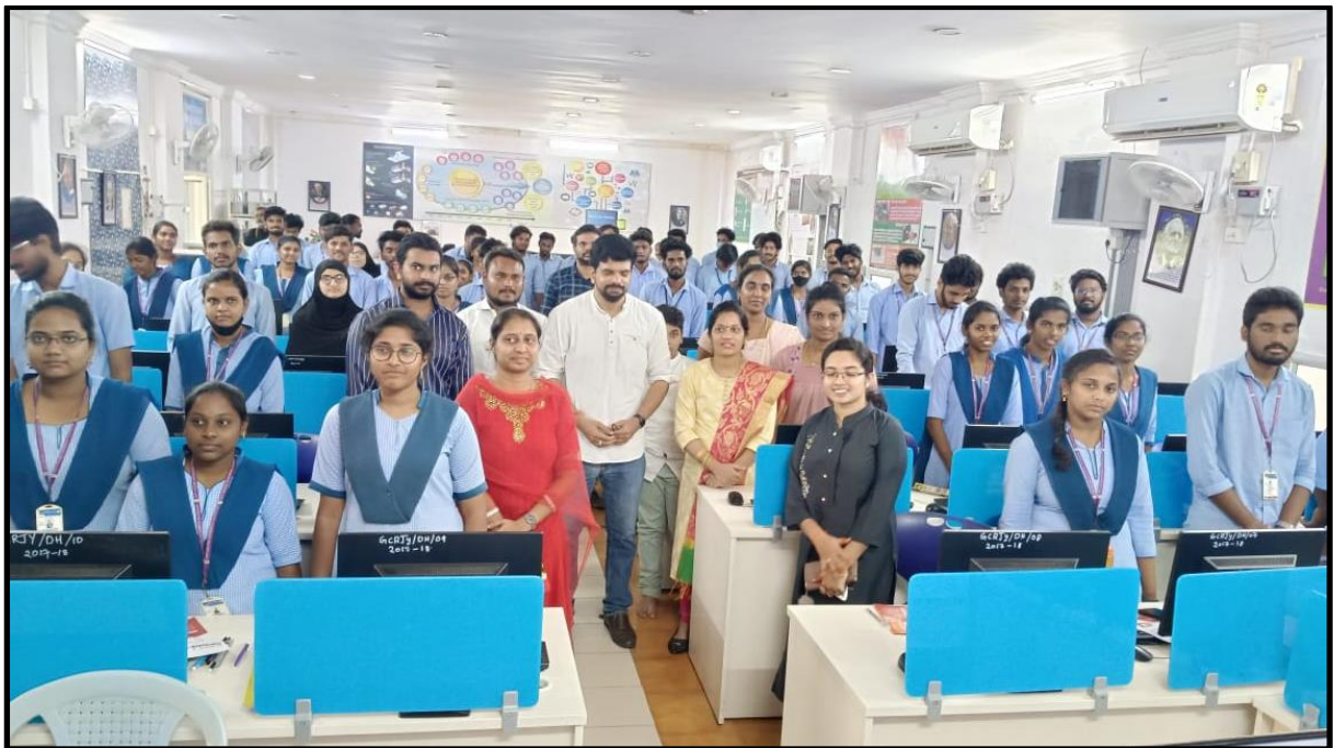
Fig 4: Closing session