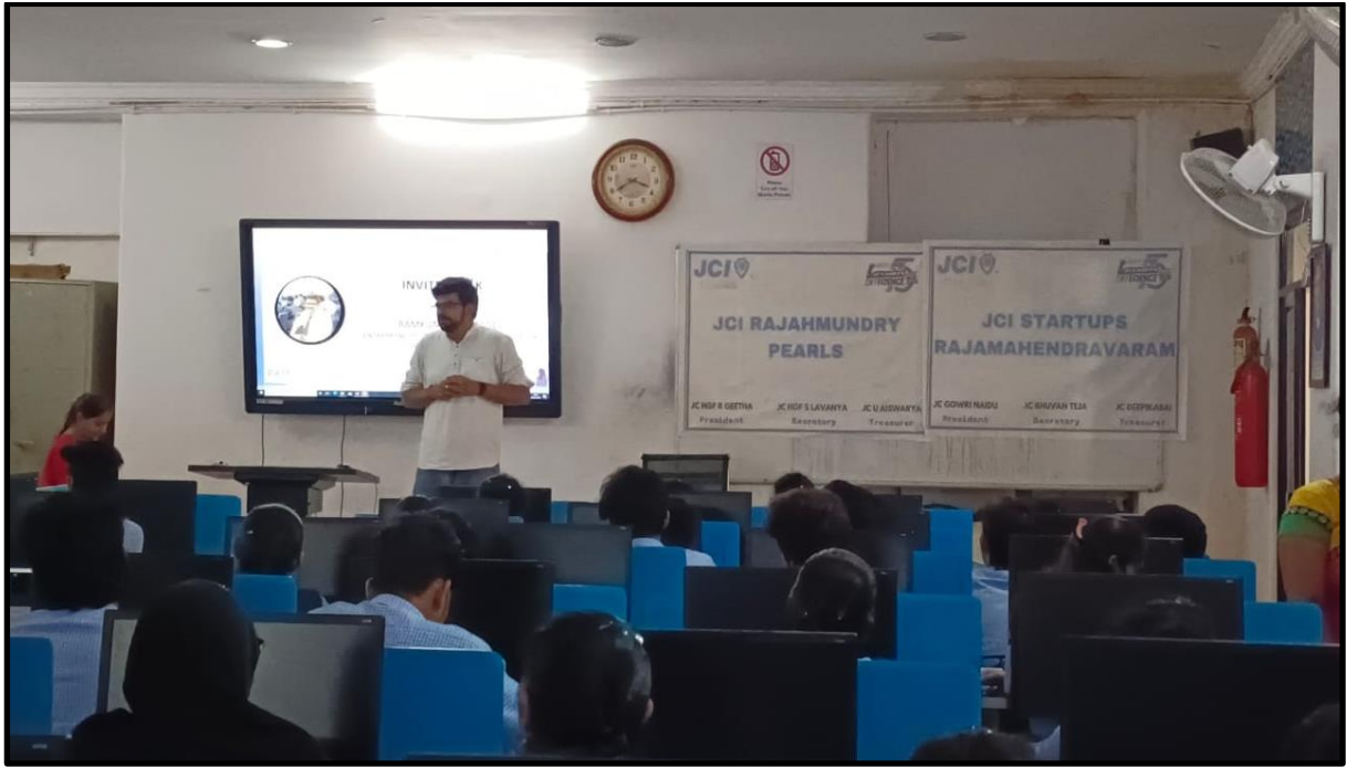
Fig 3: Resource person delivering lecture