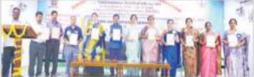
సదస్సులో పాల్గొన్న వివిధ రంగాల ప్రముఖులు