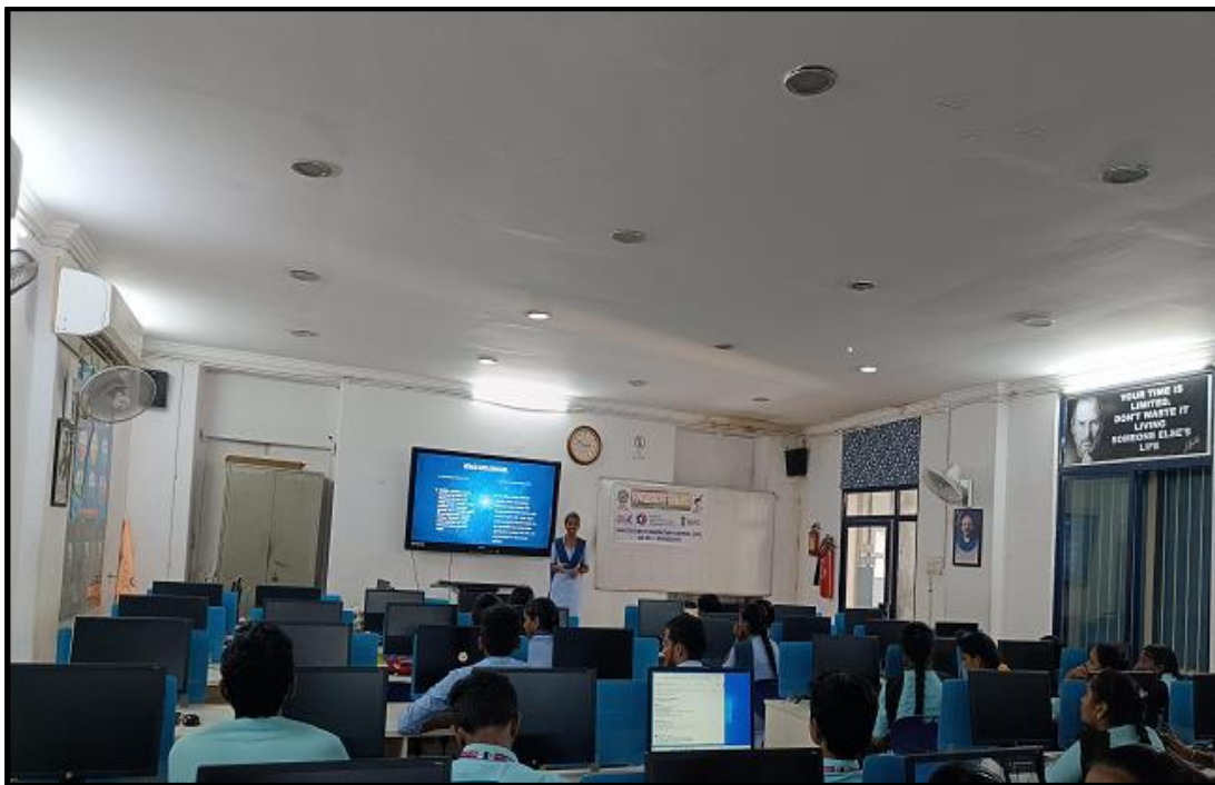
Student Presenting Power point presentation