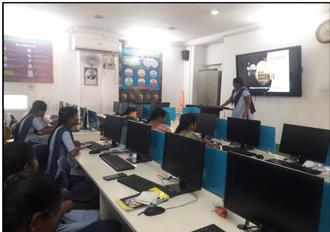
Student presenting power point on Indigenous technologies