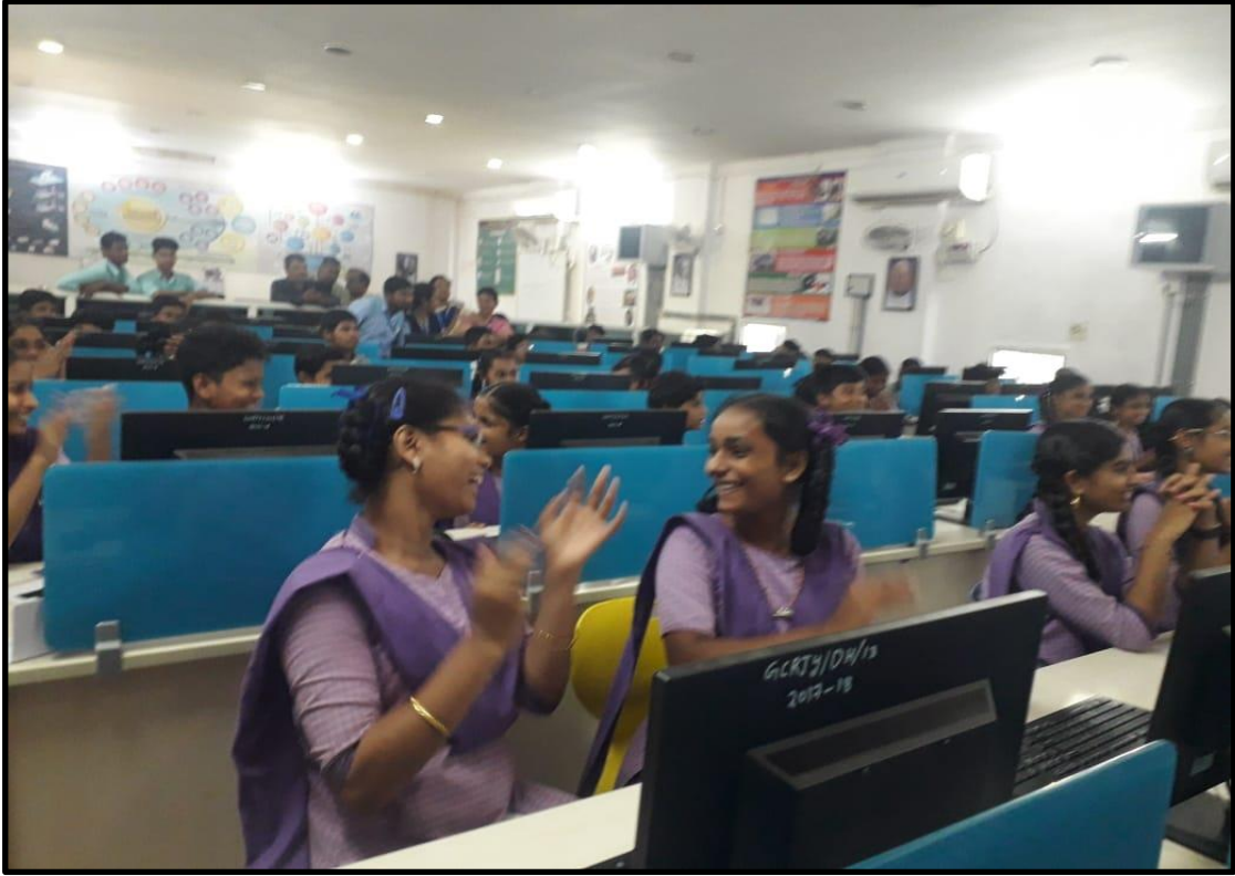
Students Participating Quiz Competitions