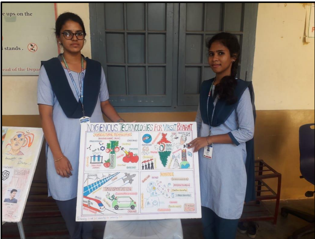
Students presenting their ideas on Indigenous Technologies