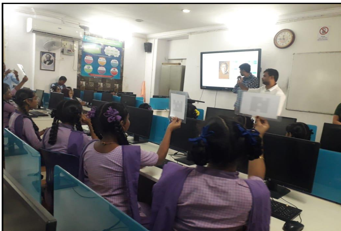
Students participating in screening test through picklers