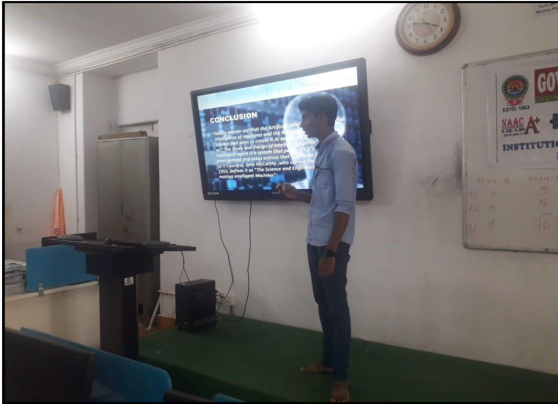
Student presenting power point on Indigenous technologies