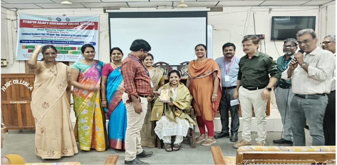
KEY RESOURCE PERSON IN TOT PROGRAMME